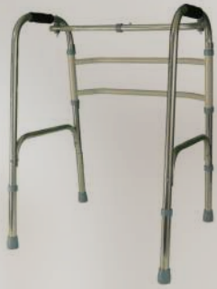
Folding Walking Aid