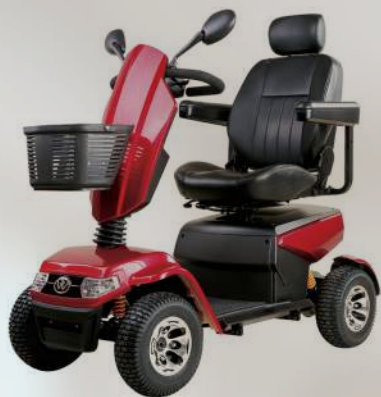
Scooter for the elderly