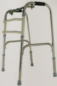
Folding Walking Aid