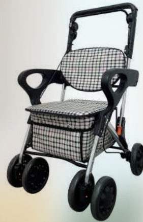
Elderly Shopping Cart