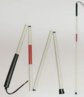
Four Section Folding Blind Stick