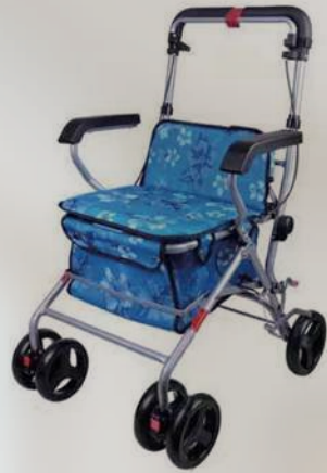
Elderly Shopping Cart