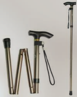
Four Section Folding Walking Stick