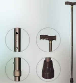
Adjustable Walking Cane