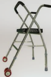
Walking Aid With Wheel And Seat