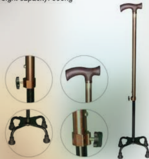
Four Angle Aluminum Alloy Walking Stick