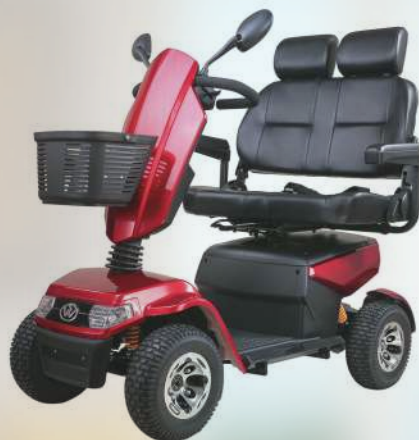
Scooter for the elderly