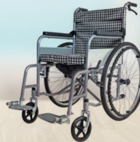
Manual wheelchair-Grid wheelchair