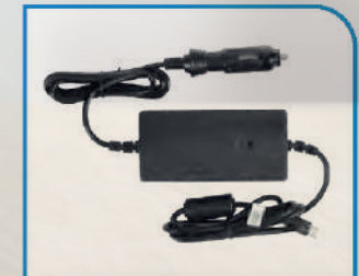
DC power adaptor (Optional)