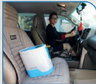
Use in Car