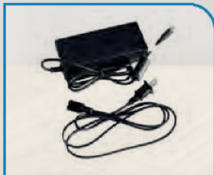
Type-C power cord